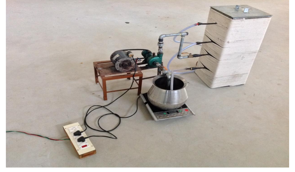
Fig 2: Experimental Setup

\Delta Tm = average temperature difference between the fluids.