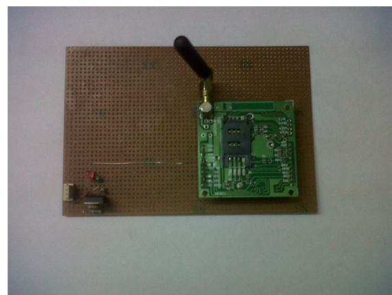
Fig.1 Image of GSM Module

The GSM Modem supports popular "AT" command set so that users can develop applications quickly. The product has SIM Card holder to which activated SIM card is inserted for normal use. The power to this unit can be given from battery connected with solar panel to provide uninterrupted operation.