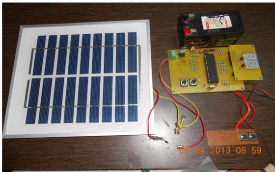
Fig.2 Components of the system

1) GSM module: This will provide a network to the project by use of antenna. LED will on after every 3 seconds if network is there. Module will be started by use of AT commands. Call and message can be done by this module. It will get continuous supply from battery. The GSM Modem supports popular "AT" command set so that users can develop applications quickly. The product has SIM Card holder to which activated SIM card is inserted for normal use.