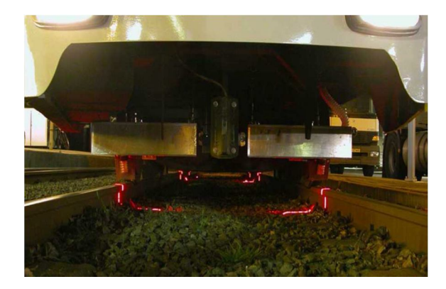
Fig.3: Alignment of Ultra sonic sensors

Once the tracked length has reached desired failure level the sensors send a signal to the micro controller to send message to sever about failure detection in term of location information.