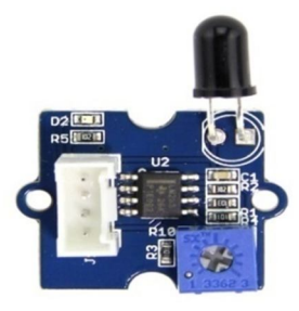
Fig. 5: The fire sensor used to determine the surveying system

The fire sensor circuit is too sensitive and can detect a rise in temperature of 10 degree or more in its vicinity.[7] Ordinary signal diodes like IN 34 and OA 71 exhibits this property and the internal resistance of these devices will decrease when temperature rises. In the reverse biased mode, this effect will be more significant. This indicates normal temperature.